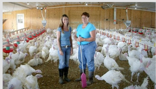
That's not chicken scratch!

Canada has over 550 turkey farmers? Total value—over $382 million dollars according to the Turkey Farmers of Canada.