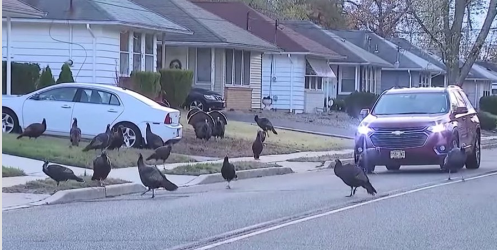
Wild turkeys surprised residents of Tom's River, New Jersey in time for Thanksgiving